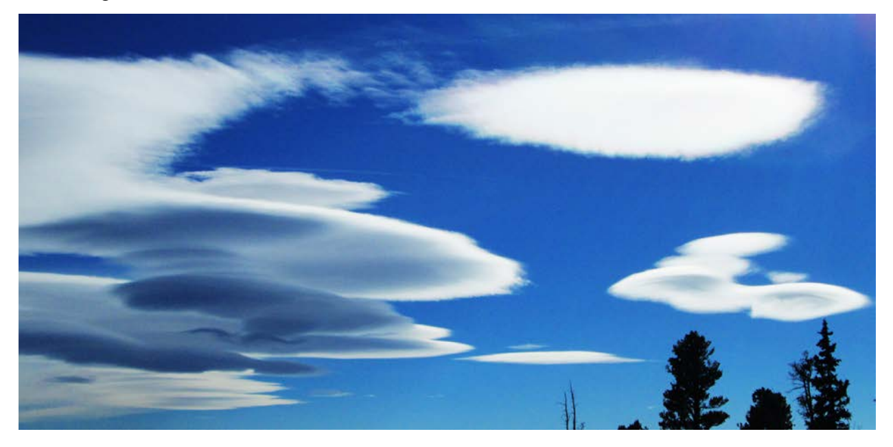
Fig. 3: Student work from Flow Visualization course. Altocumulus lenticularis (mountain wave clouds) form as air streaming over the Rocky Mountains bounces over Eldora CO, January 20th, 2013 at 1:30pm. Assignments that require capturing existing fluid phenomena, such as clouds, also encourage expanded perception.

knowledge. Students express a deepening understanding of core concepts in the pursuit their aesthetic goals [27].